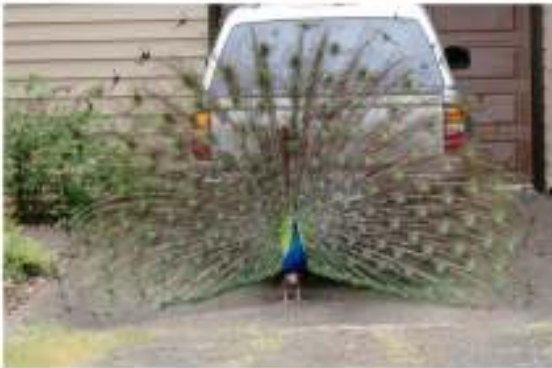
A PEACOCK NAMED PETEY

Here are a few shots taken by the lucky ones among us.